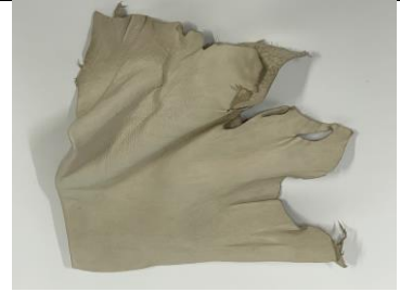
Tanned leather piece - white