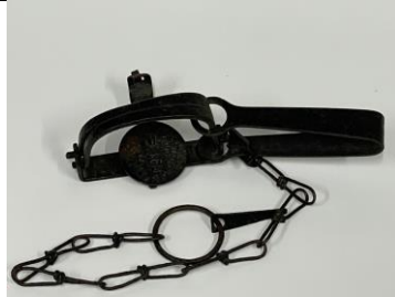
Metal animal trap