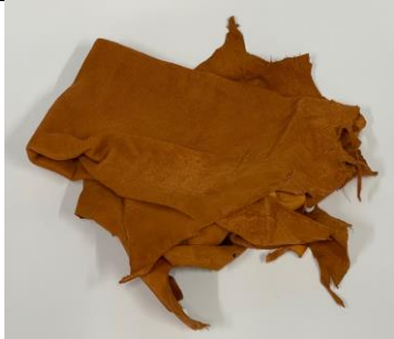
Tanned leather piece - brown