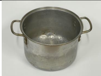
Metal cooking pot