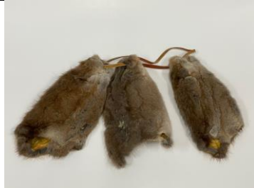
Mink pelts (3) on a leather strap