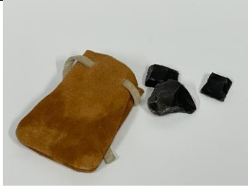
Flint stones in leather pouch