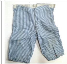
Boys Sailor Suit Bottoms