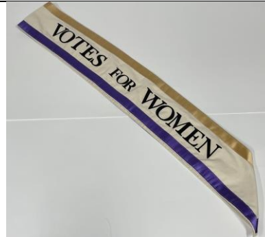
Votes for Women Sash