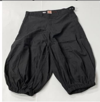
Men's Swimsuit or Athleticwear