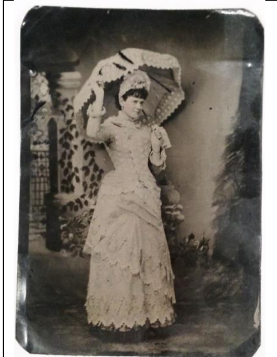
Photo of woman holding a parasol