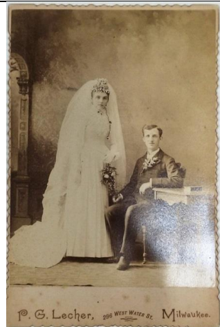
Photo of bride and groom