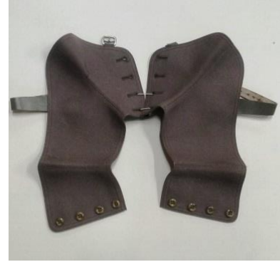
Men's Gaiters or Spats (goes over shoes)