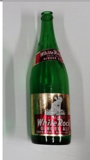
White Rock Bottle