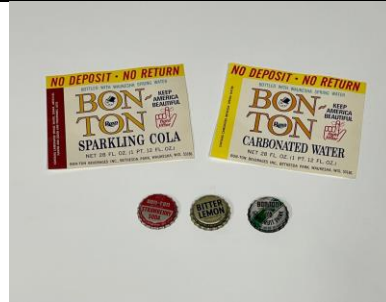
Bon-ton Cola Labels and Soda Bottle Caps