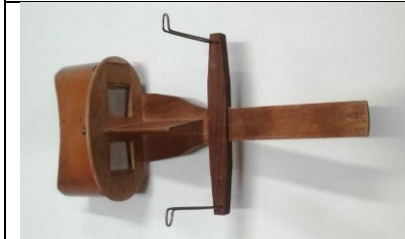
Stereoscope and 2 Images