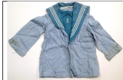
Boys Sailor Suit Top