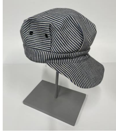
Railroad Engineer Cap