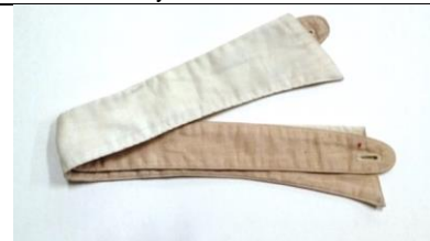
Men's removeable collar