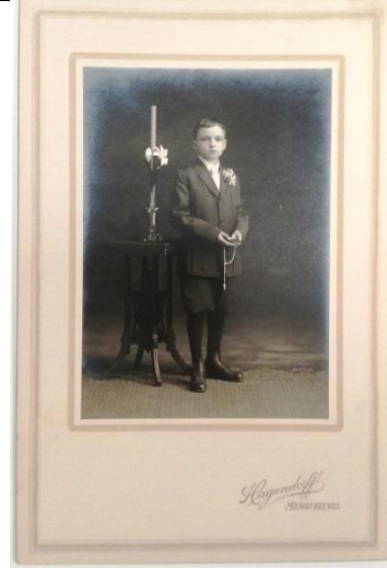
Photo of boy holding a rosary