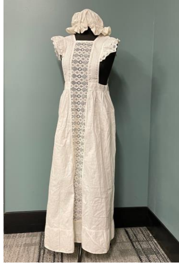
Maid's apron and cap