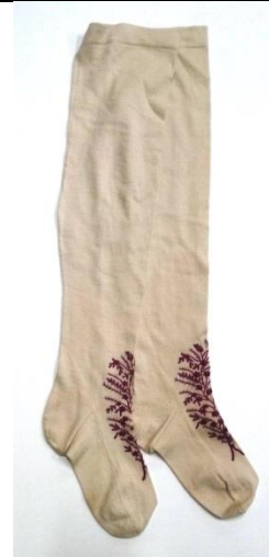
Machine-made women's stockings with hand embroidery