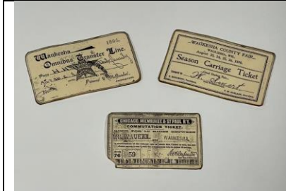
Omnibus and Trolley Tickets