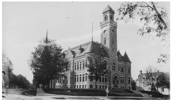
Historic Waukesha County Courthouse

What year did Waukesha County separate from Milwaukee County? _____