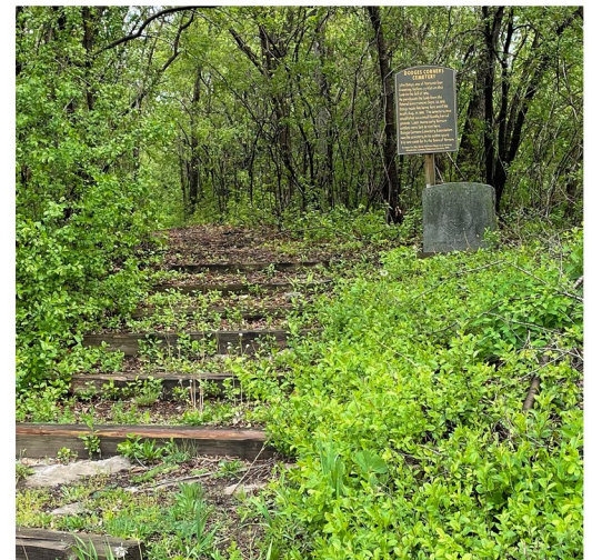
Dodge Corners Cemetery Marker

Head up the stairs and take a few minutes to explore the cemetery.