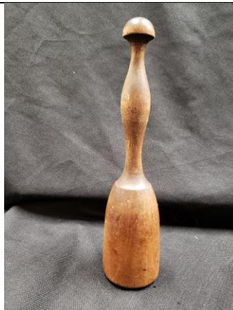
Potato Masher – called a beetle