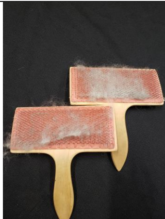
Wool Carding Combs (2)