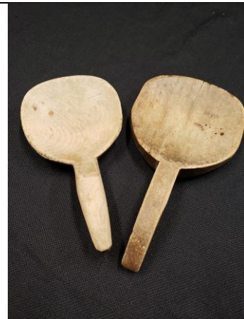
Butter Paddle (1)