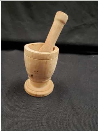
Morter and Pestle