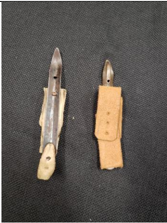
Corn Huskers (2)