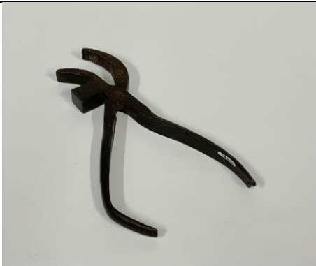
Carpenter Pinchers (pliers)