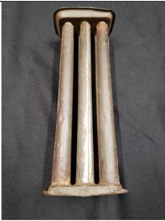
Candlestick Mold - metal