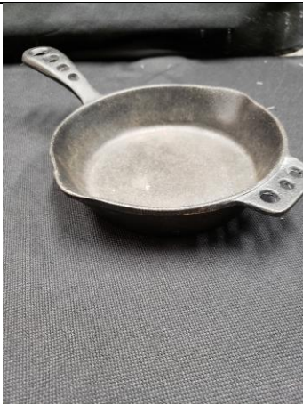
Cast Iron Pan