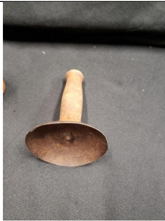
Hide Scrapers - Hogs