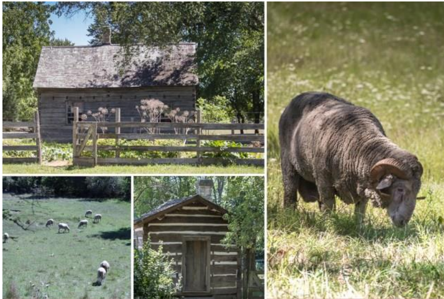
Norwegian Homestead – Old World Wisconsin

The Pioneer Life Discovery Box contains items that help students understand and explore what life was like for European and American pioneers who came to Wisconsin in the 1800s. Many of these settlers started out as farmers but most soon turned to other industries in order to make a living in this state. Before communities were established, pioneer families had to grow or make many things they would trade for or buy if they lived in a large community.