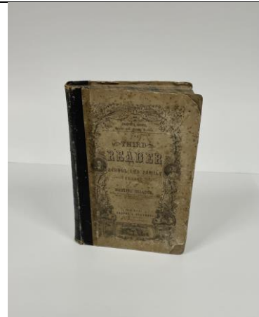
School Book - Reader