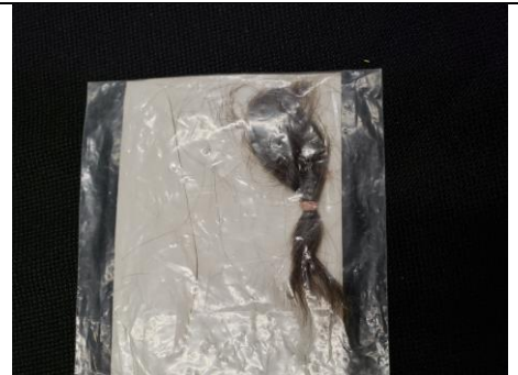
Hog (pig) Hair - in binder