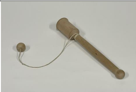
Wooden Cup and Ball Game