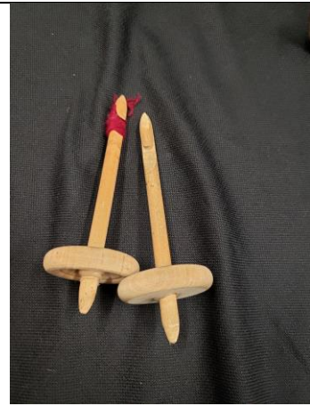
Drop Spindles (1)