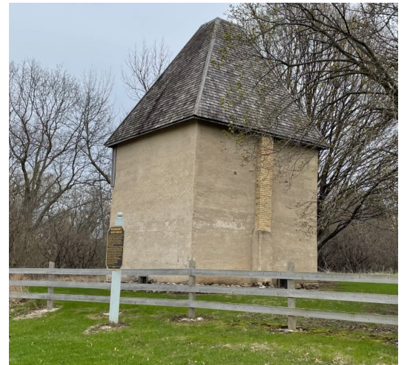
Beaumont Hop House